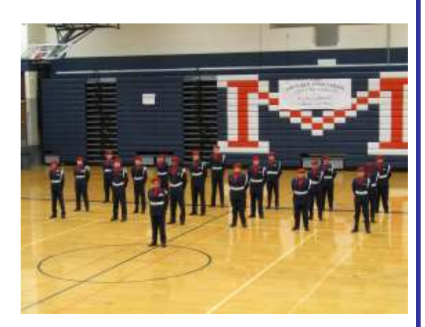
Mitchell High School Exhibition Drill Team

JROTC Unit from Mitchell High School with