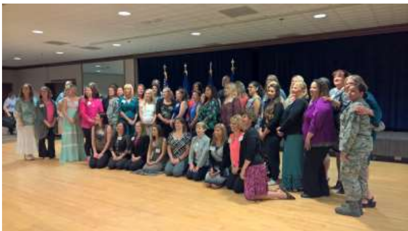
Attendees at the Key Spouse Luncheon