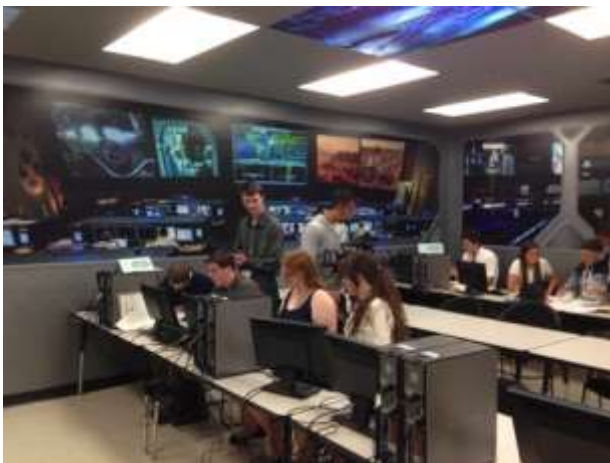
The Rangeview H.S. Space Raiders develop options at the Discovery Center.

StellarXplorers newsletter, the StellarNews, and a flier announcing the opening and the web site where registration begins, should you have any high school-age organizations that might be interested in fielding a team. Registration for the new season opened on May 1st!