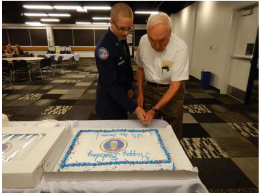
Oldest and Youngest AF Member