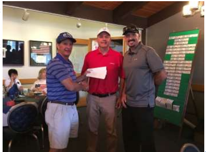
IMAGE 2016 was held on 19 Aug at Eisenhower Golf Course at the United States Air Force Academy, where 108 golfers participated. We were supported by 25 generous sponsors, including: Lockheed Martin, Pennica Financial Group, MTSI, Infoblox Federal, ForeScout, Summit Technical Solutions, Great Wolf Resorts, Inc., The Antlers Hotel, Apex Systems, Blackstone Technology Group, Rocky Mountain Wireless Solutions, General Dynamics IT, ASRC, Stellar Solutions, GTRI, Harris Corporation, Aerotek, RIM Technologies, Lexus of Colorado Springs, TEKsystems, IMG, Hotel Elegante, SGT, and Webster University.

Started in 2000, the Industry Military Annual Golf Event (IMAGE) provides the opportunity for military and industry to have some fun and play a round of golf for a great cause. The Lance Sijan Chapter of the Air Force Association (AFA), and Rocky Mountain Chapters of the National Defense Industrial Association (NDIA) and the Armed Forces Communications Electronics Association (AFCEA), all work together to raise money for science, technology, engineering, and math (STEM) scholarships and related STEM activities. Each year, we collectively award over $60k to deserving students and STEM activities, with IMAGE providing a substantial portion of those funds. This year, we raised approximately $18,000. IMAGE is a premier networking event within the defense marketplace in the Springs.