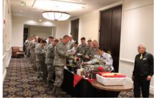
Buffet line for Day One Enlisted Professional Development

vulnerability of these systems to hacker attack made the digital universe yet another venue for military operations. These six separate domains include: air, land, maritime, subsurface, space and cyber. The Air Force has the dominant air arm; it "owns" space operations; and is an important component in the new Cyberwarfare Command, resulting in greatly expanded responsibility for operations across the newer domains.