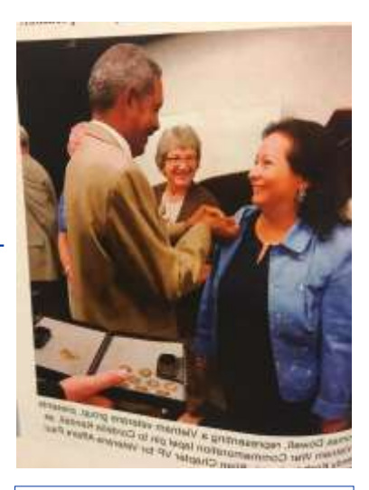
The picture that started it all

When Dad got home from his trip I couldn't wait to hear his stories and about the time he had while they were there! The joy and excitement he had while telling us all was like a kid on Christmas morning and it makes me happy to