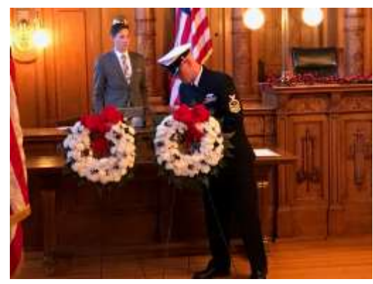
Memorial wreaths were placed by a member of each service