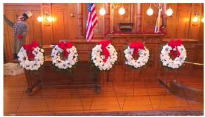
Memorial wreaths for all services at the Pearl Harbor Ceremony

Air Force, Army and Coast Guard. It was a moving moment which captivated the audience, and was made even more special and hit an emotional nerve when a Fort Carson soldier played "Taps" on the trumpet. It