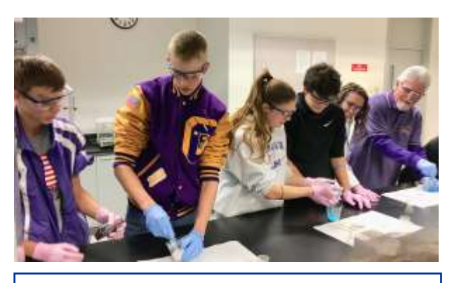
Cotopaxi Students and staff make polymers at the USAFA Chemistry Labs