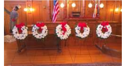
Memorial Wreaths at the Pearl Harbor Observance

The Lance P. Sijan Chapter is so proud to be a Silver Sponsor for the annual Pearl Harbor Observance, which was held this year at the Pioneers Museum in Colorado Springs. On December 7<sup>th</sup>, 1941 353 Japanese aircraft conducted the attack in two waves launched from six enemy aircraft carriers over a period of 90 minutes. On the tragic day, 2459 individuals were killed in action and 1809 wounded, including 1177 on the USS Arizona. Twenty-two U.S. ships and 347 U.S. aircraft were out of action because of the attack. War was declared by the United States on December 8, 1941.