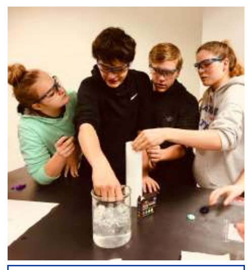
Testing the Orbs at Chemistry Polymer Activity