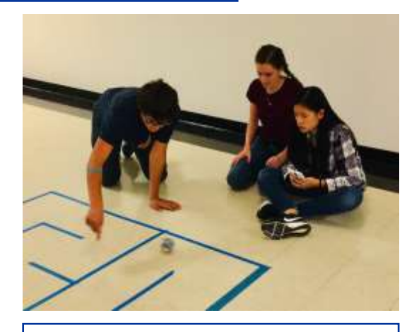
The winning team at the Sphero SPRK+ robotics challenge programs their robot to negotiate the maze