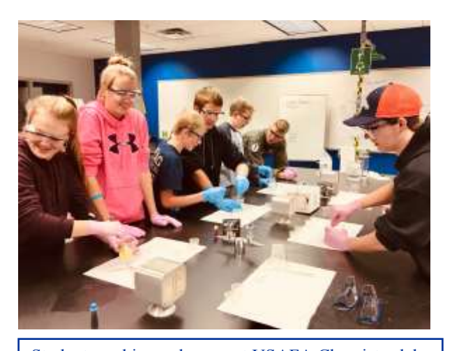
Students making polymers at USAFA Chemistry labs