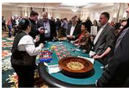
Busy Game Tables all Evening