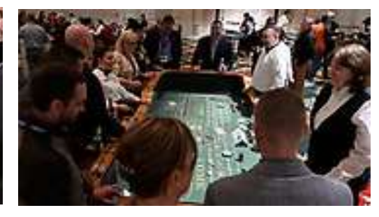
Busy Game Tables all Evening