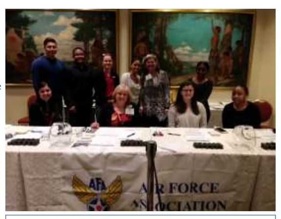
Attendees kept volunteers hopping At the Registration Desk

Close to 400 eager participants lined up to head to the gaming tables at the Broadmoor in support of the third year of fundraising for the Air Force Association Wounded Airman Program (WAP). Held in conjunction with the Rocky Mountain Cyberspace Symposium hosted by the Armed Forces Communications and Electronics Association (AFCEA), attendees enjoyed the symposium by day and unwound at the gaming tables for the evening of February 4th. With a $5 preregistration fee, guests were entitled to a door prize ticket and a ticket for $100 in chips to use for the games. Late arrivals who were not pre-registered paid $20 to receive $200 in chips and a door prize tickets. Attendees received an additional $150 in chips and a door prize ticket for every $20 donated. With their chips, the guests tried their luck at various games of chance at tables manned by professionals. Every $400 in winnings earned another door prize ticket.