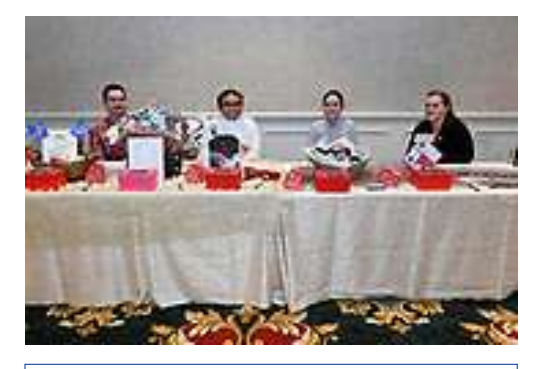
Awesome Prizes for the Winners