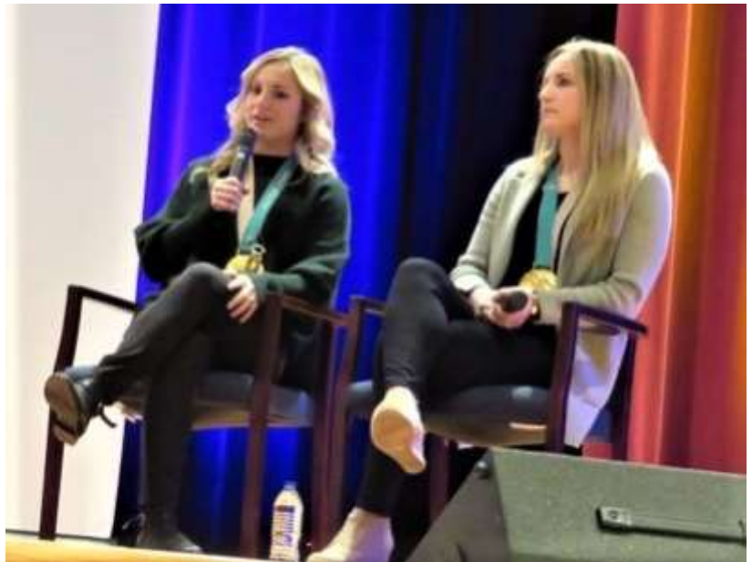
US Women's Hockey Team stars Jocelyne and Monique Lamoreaux