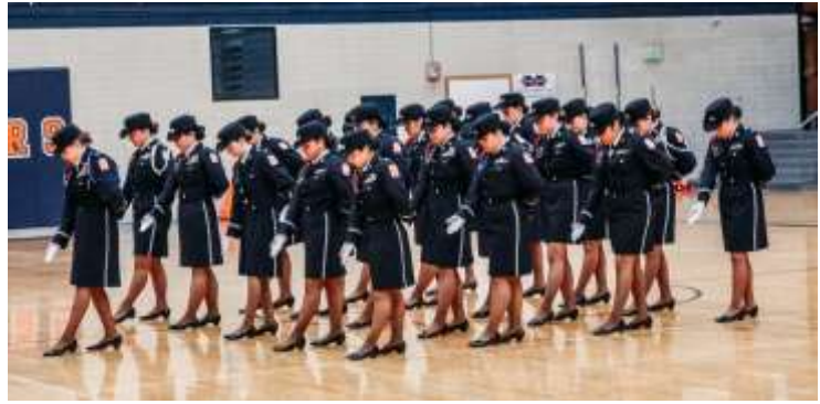
John F. Kennedy High School JROTC Exhibition Drill Team