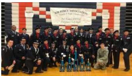
Mitchell HS JROTC Runner-up Commander's Trophy Drill Team