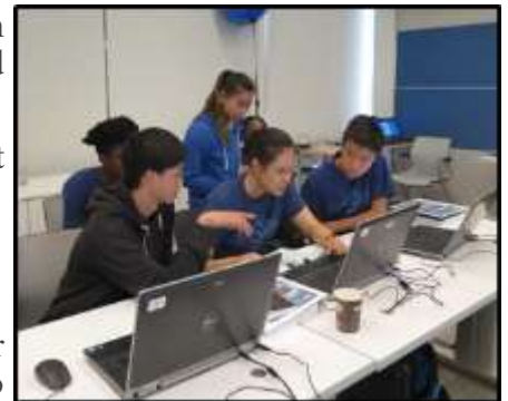
Students participating in AT&T's 2019 Cyber Camp

The 2020 Camp will begin with an introduction to cybersecurity career opportunities, cyber ethics, online safety, how computers work, cyber threats, cybersecurity principles, and virtual machines. Campers will also get a rundown of Windows 10 basic security policies and tools, account management, file protection, auditing, and monitoring. To build onto their new cyber knowledge, the campers will also be introduced to Linux, Ubuntu 16 terminology and concepts, Graphical User Interface (GUI) security, basic command line security, and intermediate Ubuntu security.