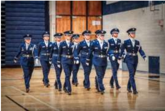
William Mitchell High School JROTC Regulation Drill Team