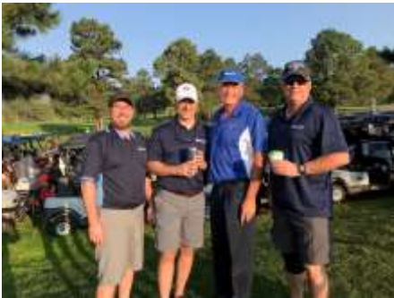
Sijan Chapter Secretary at IMAGE with his ENESCO team

Started in 2000, IMAGE provides the opportunity for military and industry to have some fun and play a round of golf for a great cause. Rocky Mountain Chapters of the Air Force Association (AFA), National Defense Industrial Association (NDIA) and the Armed Forces Communications Electronics Association (AFCEA) all work together to raise money for science, technology, engineering, and math (STEM) scholarships and related activities. Each year, we collectively award over $100k to deserving students and STEM activities, with IMAGE providing a substantial portion of those funds. IMAGE is a premier networking event within the defense marketplace in the Springs, and is definitely a great way to meet counterparts from industry and military while gaining a better understanding of issues and opportunities facing our community. With 148 golfers teeing off in perfect weather, the event netted roughly $33,000 to be divided three ways among AFA, NDIA and AFCEA Chapters. The golf tournament is the primary source of funds so Sijan Chapter may continue to provide annual scholarships through the aerospace education programs. After a sumptuous Prime Rib lunch, awards were handed out thanks to the gracious and generous support from our sponsors: