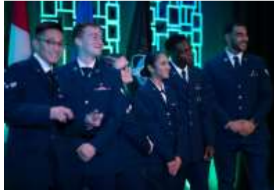
Junior Ranking Airmen and Guardians enjoying the Ball