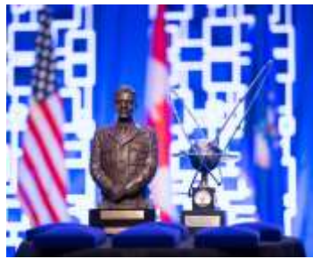
The last General O'Malley Space Leadership Award and the new O'Malley Space Vision Award