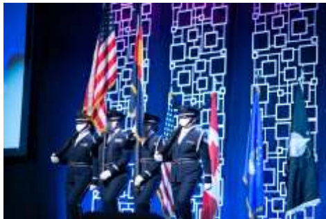
Mitchell AFJROTC Honor Guard