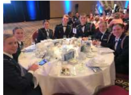
Arnold Air Society Cadets from Det 90