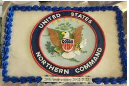
Special US Northern Command Anniversary cake enjoyed by all.